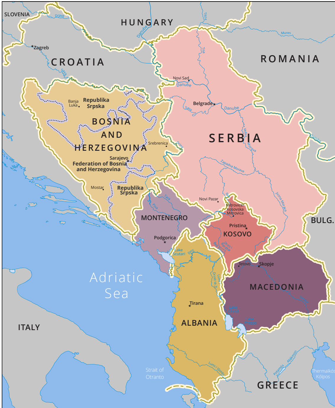
Figure 1: Map of the Western Balkans