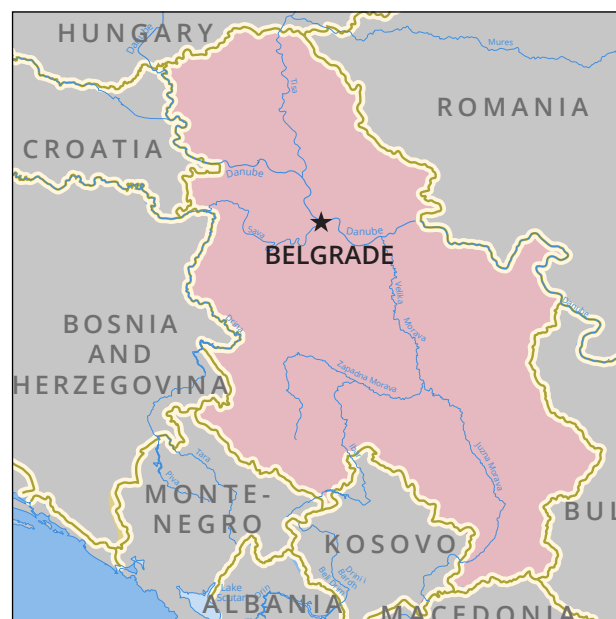
Figure 7: Map of Serbia