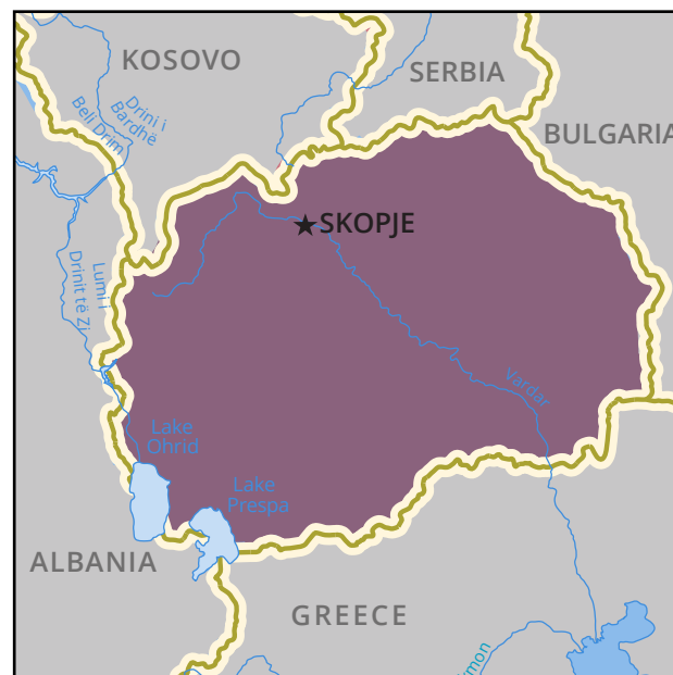
Figure 5: Map of Macedonia