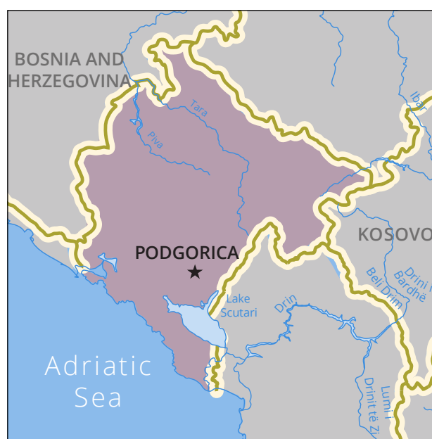
Figure 6: Map of Montenegro